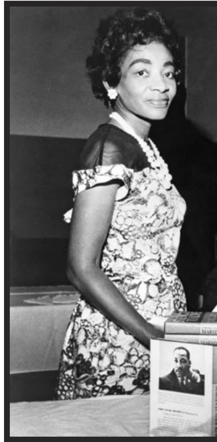
Martin Luther King, Jr., signing a copy of Strength to Love with Coretta Scott King.

King's concern about poverty, human rights, and social justice is clearly present in his earliest handwritten sermons