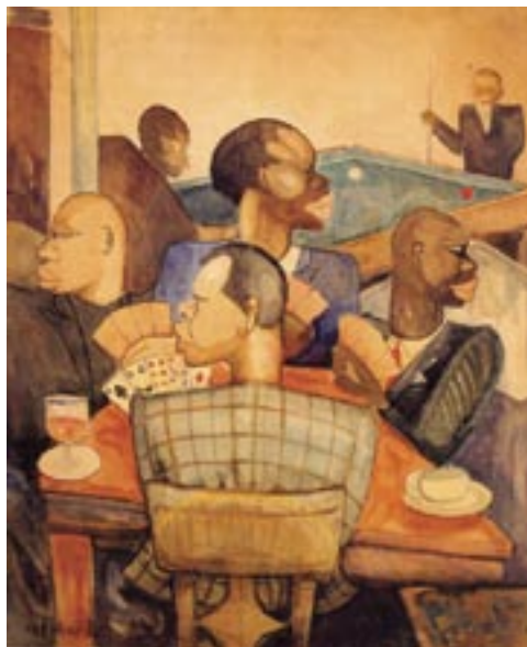
Nous Quatre a Paris (We Four in Paris) Palmer Hayden (American, 1890-1973)

also provide a forum for an emerging field of study. The main areas of interest include 1) the African American experience in Paris and the idea of an “escape” from racism in the United States; 2) “Paris” as French empire with reverberations between metropole and colony; 3) Black French “citizenship” within the current politics of immigration; 4) historical and contemporary representations of race; and 5) Paris as an historical site of twentieth-century Black Internationalism. Recognizing that each of these areas link up or interface in a diversity of interpretative takes on diaspora, AAAS offers lectures on the structural, discursive, historical, artistic, and literary explorations of “Paris’ Noir.”