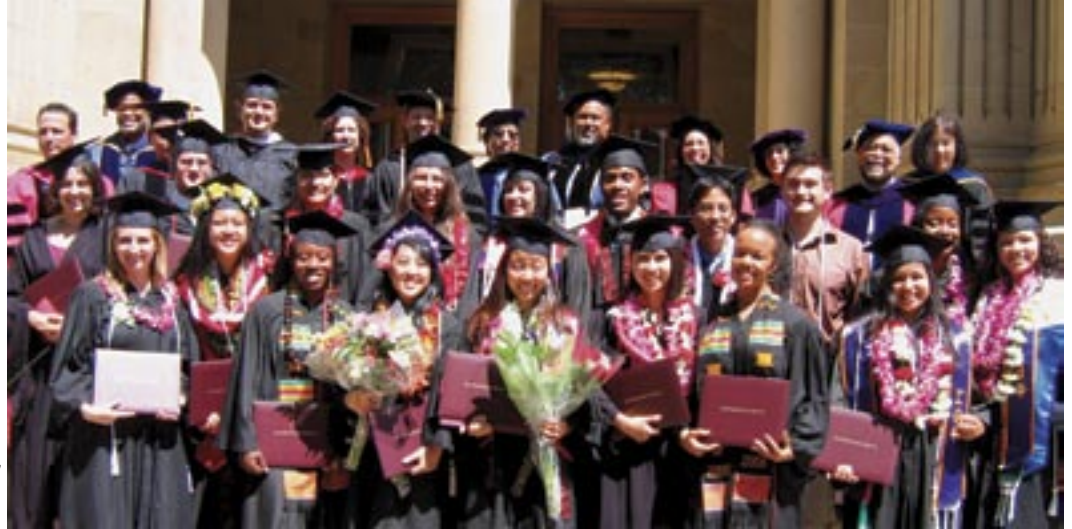
CSRE Faculty and Degree Candidates 2005-06